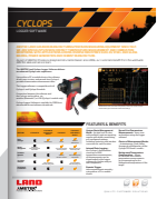
CYCLOPS LOGGER SOFTWARE

SEE OUR OTHER RELATED LITERATURE FOR THE CYCLOPS L: