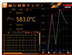
The Table View showing Instantaneous, Valley, Average and Peak, plus the unique Meltmaster temperature (on the 055 L model) readings.

The Trend View displays Peak, Instantaneous, Average and Valley temperatures, Logger settings, Route Manager, Background Correction plus Timed Logging (taking measurements at pre-defined intervals between 1 and 60 secs).